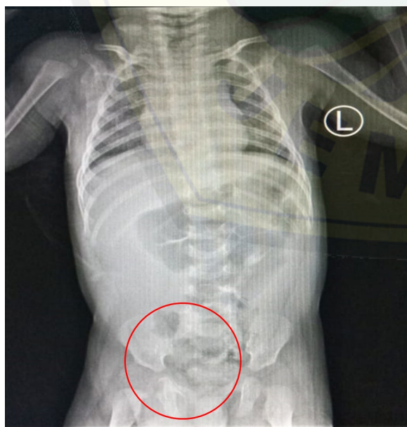
Fig. 2 Plain abdominal radiography

During laparotomy exploration, we found inguinal sac with intestinal and appendix content in the sac (Fig. 3a). The inflamed appendix but there was no perforation sign that indicate the type II of Amyand's Hernia as intraoperative diagnosis. In the edge site of the sac we found hyperemia mesenteric cyst on the retrocaecal in the canalis inguinalis (Fig. 3b). Appendectomy, cyst resection and hernia closure were done. Then the cyst resection was presented to histopathology examination.