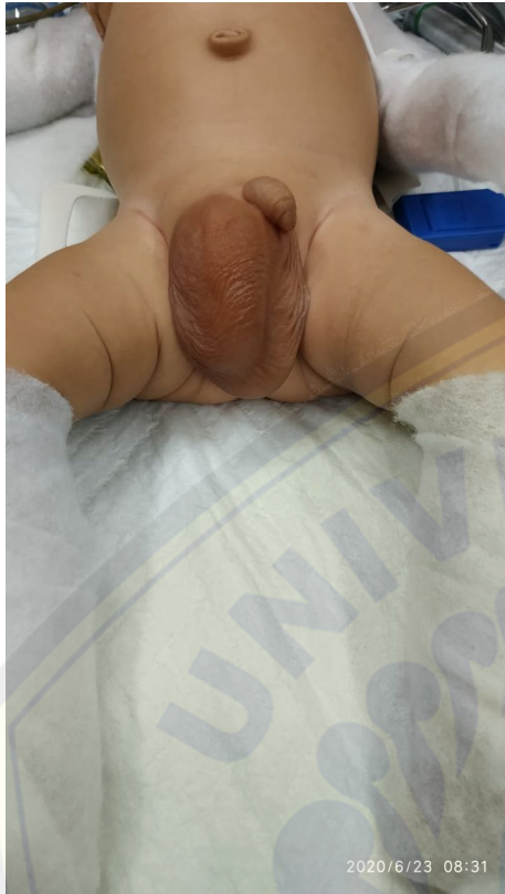
Fig. 1 Enlarging mass in the right scrotal