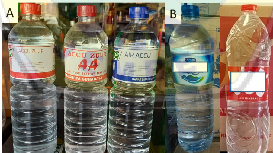
Fig. 2. A. Accu water ( H_2SO_4 ), B. Drink water.

pyloric mucous will induce progressive tissue inflammation that indirectly will cause pyloric obstruction. The pyloric obstruction will appear commonly 4–6 weeks after ingestion [7]. In this case, the pyloric obstruction occurred 30 days after ingestion.