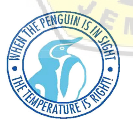
Fig. 2 Application of thermochromic ink [15]

The consumer label is a partial-history indicator that change colour when exposed to higher than recommended storage temperature and will also change as the product reaches the end of its shelf-life. The working principle is