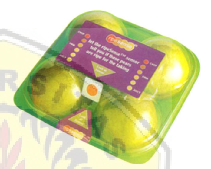
Fig. 7 ripeSense <sup>TM</sup> the world's first smart ripeness indicator label [27]

Modified atmosphere packaging (MAP) and equilibrium MAP are classified as active packaging methods [33]. In these cases, the atmosphere of package is not air but