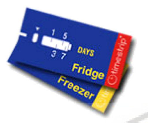
Fig. 4 Timestrips<sup>®</sup> TTIs product from Timestrip Plc [17]