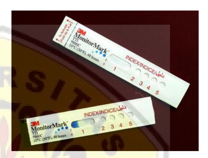
Fig. 3 MonitorMark<sup>TM</sup> TTIs product from 3M<sup>TM</sup> [16]

based on the melting and diffusion of the blue dye as described previously [16].