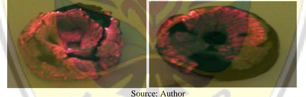
Figure 1. Formulate 1

The good quality of briquette will determined by the right proportional material and adhesive. We should find the right material and composition to produce the good briquette. Some research showed that molasses, clay and carbonized bagasse (1:1:40) can produced the best physical characteristic such without sparks and smokeless than other material ratio proportion [13]. Not only the main material, The choosing adhesive and their proportion were important to produce the good quality of briquettes, the the optimum composition of the material with the adhesive were 50% [14].