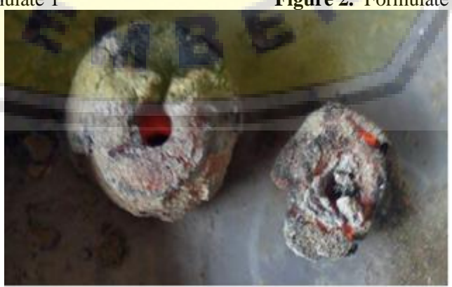
Figure 3. The formulate 1 faster become ashes than formulate 2