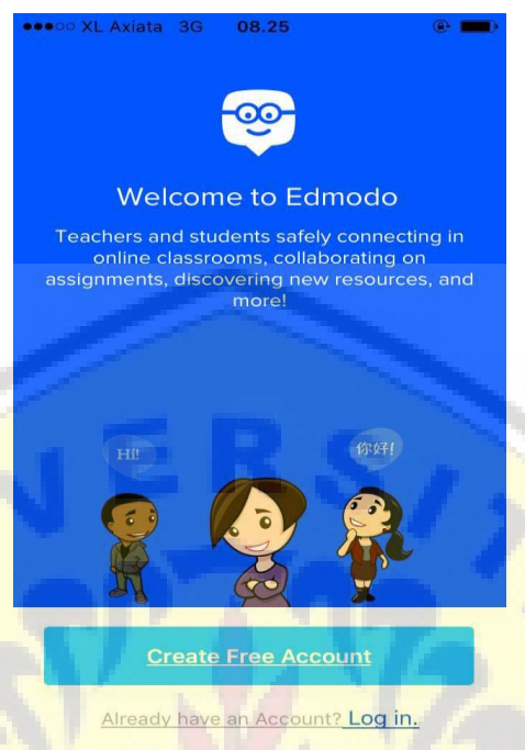
Figure 1. Home of edmodo

3.2 Result of Edmodo Usage Questionnaire I Schools As A For LEarning History In The Digital Age