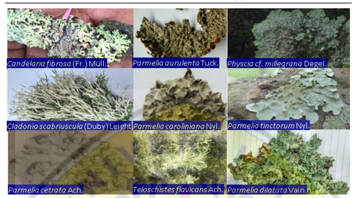
Figure 2. Nine lichen samples collected from Meru Betiri National Park, Jember, Bondowoso and Pasuruhan Districts. Candelaria fibrosa (Fr.) Müll., Parmelia aurulenta Tuck., Physcia cf. millegrana Degel., Cladonia scabriuscula (Duby) Leight, Parmelia caroliniana Nyl., Parmelia tinctorum Nyl., Parmelia cetrata Ach., Teloschistes flavicans and Parmelia dilatata

Ari Satia Nugraha et al., / TBAP 9 (1) 2019 pp 39 - 46