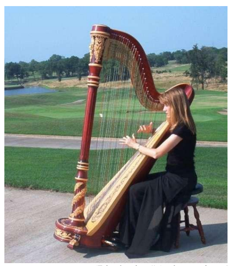
(Taken from http://mixgalaxyrecords.com/)