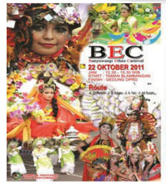
Figure 3. Poster of BEC I year 2011 (left). Poster of BEC III year 2013 (center). Poster of BEC VI year 2016 (right). Downloaded from The Regency of Banyuwangi's Website.

This good news is an opportunity to improve people's economic activities such as parking officers, traders, travel agents, hotels, and restaurants that potentially elevate society's living standards. Nevertheless, increasing living standards should be paralleled by improvement of life quality that is of people's ability to earning and adding more sources of income and limiting expenses of nonprimary needs. In addition to alleviation of poverty, development also led to mental-spiritual, religious, cultural, and nonphysical aspects to bring into reality people with physical and mental prosperity and good attitude, as the following quote implies.