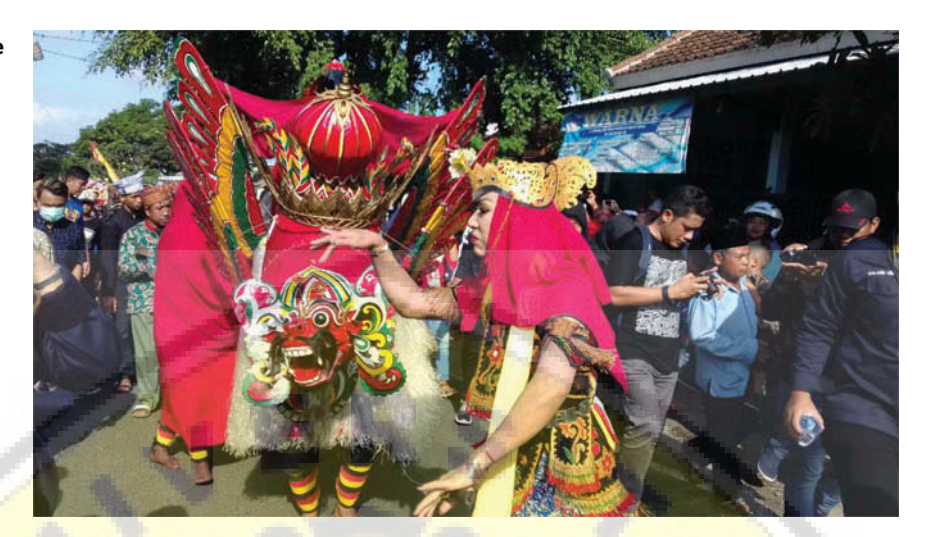
Figure 1. Barong Kemiren dance at Kemiren Banyuwangi East Java Indonesia, 16 June 2018. Researcher's documentation.

The above description suggests that the arrangement of BEC is multifunctional as it (1) extends multicultural spirit, (2) enhances quality and productivity of art/ritual performers and their supporters, (3) supports tourism industry, (4) promotes Banyuwangi's culture to international community and persuades them to come, and (5) reinforces Using people's and Banyuwangi people's identity. In the extent of carnival promotion and activity, Zois Dan Dimitrios Koukopoulos (2017:31) discussed the chances of the application of information technology. They presented a prototype of system to implement efficient carnival dissemination and exploitation. The writers did comprehensive evaluation of the proposed system to offer users various kinds of service compared to other applications for outdoor audiences.