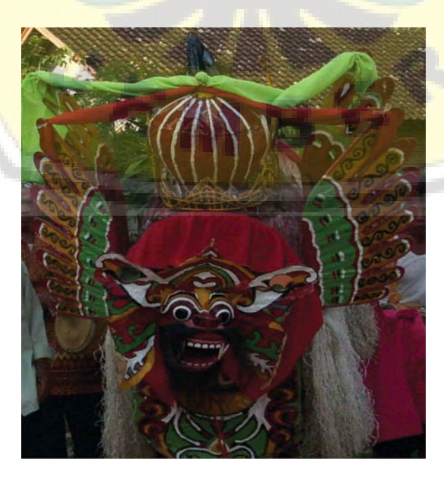
Figure 4. Barong Kemiren. Researcher's team document.