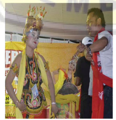
Figure 2. Gandrung with pemaju (male dancer) (left). Gandrung in the society (right). Researcher's documentation.

As a concept referring to political regulation, the government's policy in preservation and development of local culture in New Order era saw a change into serving as a management of adjusting it to meet the development demands, namely to increase regional income. In this circumstance, arts and rituals were seen more as objects and were expected to adjust themselves to the consumerist development demands. Today's policy has changed and ruined culture and art traditions through exaggerated intervention and policies oriented to commodification (Hall, 1997; Howkins, 2001; Kahn, 1995).