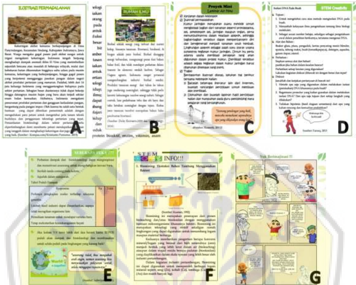
Figure 2. Integration of STEM Characteristic in the Developed Student's Book: A. Problem Illustration, B. Science Info, C. Project, D. STEM Creativity, E. How Sensitive, F. STEM Info, G. Lets Imagine