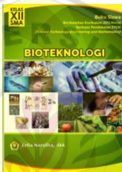
Figure 1. The Cover of the Students' Book Developed Based on STEM Approach

The students' book based on STEM approach was developed in biotechnology topic and intended for Grade XII. The student's book composed of preface, table of contents, core competencies and base competencies, the advantages of book, the character of the STEM approach, book manual, concept maps, summaries, glossary and index. In addition to the designs described above, the cover of the student's book developed was dominated by the color of green is shown in Figure 1. However, not all pages were dominated by green. The selection of green color is meant for the student's book to have a bright appearance. The effect of color on the learning process can bring more impact related to psychological effect. Broadly, the effect of color provides a positive stimulus. Some interrelated influences are attraction, attention, distinction, and warning [14].