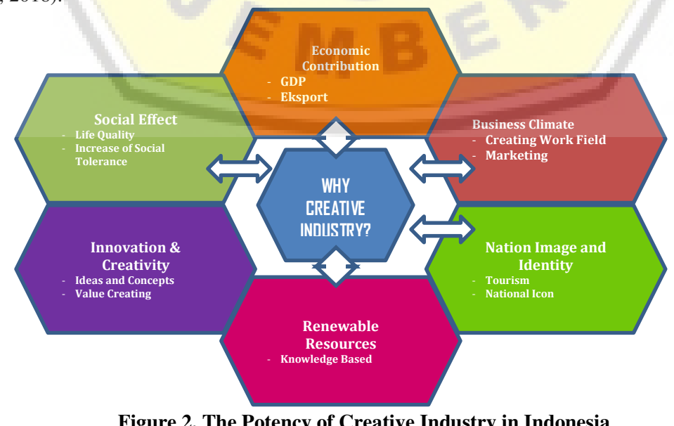
Figure 2. The Potency of Creative Industry in Indonesia

Creative industry is a new sector determined by the Indonesian Government to be managed up to the ministerial level. According to the Performance Report of the Ministry of Tourism and Creative Economy 2016, creative industry sector is elevated to the ministerial level because of its strategic values for Indonesia. The strategic values include the significant contribution, the creation of a positive business climate, the rising of the nation's image and identity, the use of renewable resources, the encouragement of innovation, and the positive social impact (www.parekraf, 2018).