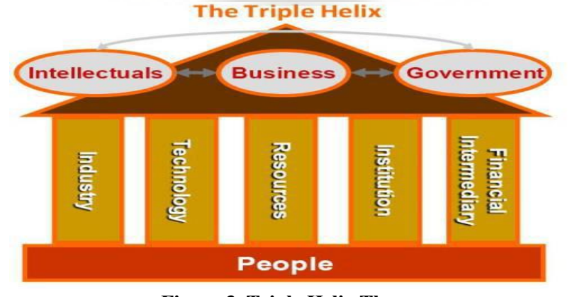
Figure 3. Triple Helix Theory

The development strategies should be supported by the participation from the entrepreneurs, intellectuals, and government as stated in triple helix concept. The role of government, business, and intellectuals is stated in triple helix theory (Etzkowitz, 2000) that can be used as the foundation of sustainable competitive development integrated with the power of government, business, and intellectuals.