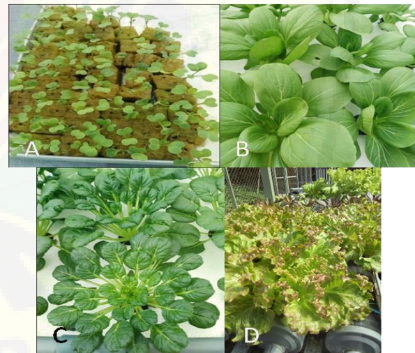
Figure 2. Seedling and vegetables ready for harvest. (A)Ready for transplanting, (B) green pakchoy, (C) Pagoda mustard and (D) Lettuce at a concentration of 1550 ppm nutrients

Leaf vegetables are used in the leaves and stems in fresh condition, so fresh weight becomes the basis for determining quality. Increased biomass caused by plants absorb water and more nutrients. Nutrition stimulates the development of organs in plants, thereby increasing the activity of photosynthesis and influencing the increase of wet weight and dry weight of plants. [5] said that the availability of nutrients plays an important role as an energy source so that the level of nutritional adequacy plays a role in influencing the biomass of a plant..