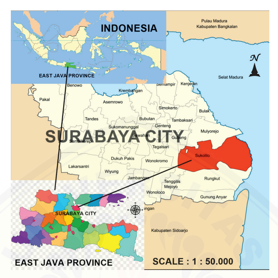
Fig. 1. Geographic location of the research area of Sukolilo Distric, Surabaya City, East Java Province in Indonesia.

journals, book articles, and other research. Population data was sourced from the Surabaya City Statistics Agency (BPS). Data on waste generation, TPS, and waste transportation equipment were obtained from the Surabaya City Environmental Agency (DLH).