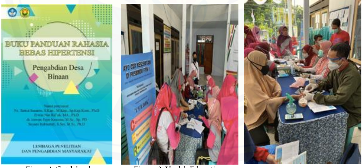
Figure 1. Guidebook

The implementation of the PTM Posbindu is carried out by existing health cadres or several people from each group/organization/institution/workplace who are willing to organize the PTM Posbindu, who are specially trained, fostered or facilitated to monitor PTM risk factors in each group. or the organization. The criteria for the PTM Posbindu Cadre include minimum high school education, willing and able to carry out activities related to PTM Posbindu.