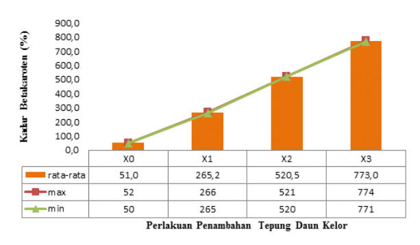
Fig 3. Average Beta Carotene Content of Catfish Meatballs with 4 Treatment Levels

Research conducted by Rudianto (2012) who added Moringa leaf flour to biscuits stated that the greater the proportion of adding Moringa leaf flour to biscuits, the greater the protein content in the biscuits [8]. Research conducted by Hasanah (2015) which added Moringa leaf flour as a mixture of catfish nuggets showed that the highest beta-carotene content was 0.0161~\mu g / g contained in catfish nuggets with a proportion of 20% catfish meat and 80% Moringa leaf flour. [9].