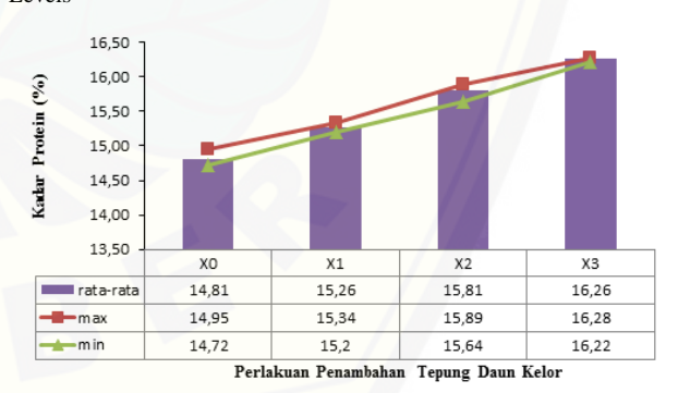
Fig 1. Average Protein Content of Catfish Meatballs with 4 Treatment Levels

Fig 2. Average Moisture Content of Catfish Meatballs with 4 Treatment Levels