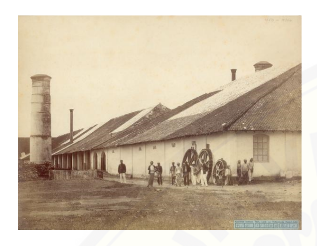
Pandjie Sugar Factory in Kapongan

Sources : "Algemeen Jaarlijks Verslag over de Kultuur in de Residentie Bazoekie over den Jaar 1835", Besuki no. 25, ANRI Jakarta; "Algemeen verslag van de Residentie Bazoekie over den Jaar 1840", Besuki no. 31, ANRI Jakarta; "Stukken Betreffende Het Onderzoek der (bij besluit van den Gouverneur-Generaal van Nederlandsch Indie, van 8 December 1853, no. 10) Benoemde Commissie voor de Opname der Verchillende Suikerfabrieken op java, lampiran D dan E"; "Statistiek Der Residentie Bezoeki 1861", Landsdrukkerij No. 137 A, Kitlv.