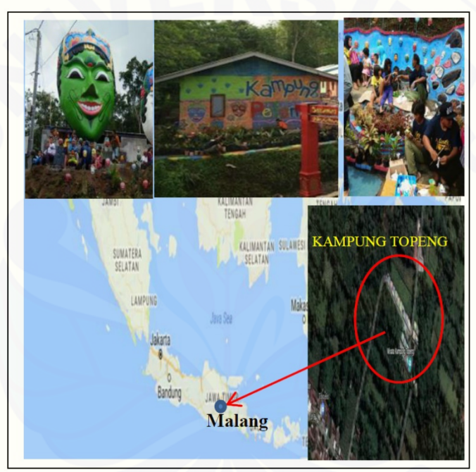
Fig 1. Location of Kampung Topeng [3][12][13].

Kampung Topeng is a successful empowerment effort as well as a national pilot project of empowerment program for PPKS (beggars). This service was started in 2015 by the Malang city government through the Malang City Social Service, namely by planning an empowerment program for PPKS. In 2016, the Malang city government in collaboration with the Ministry of Social Affairs planned a program for beggars in the form of the "Desaku Menanti" program. This location was later known as "Kampung Kesetiakawanan Sosial Margo Mulyo" or "Kampung Topeng" or "1000 Topeng Rural Tourism Destination".