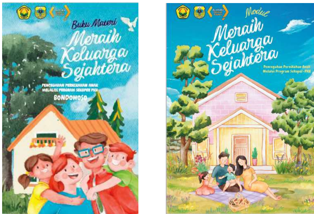
Figure 2 Reference book and Teaching Module SEKOPER PKH

There are two outputs of this activity, which is the reference book and teaching module. The teaching module contains (1) Function of the family, (2) Phase of Psychological and Reproductive development of Children, (3) Family management, (4) Impact of Child Marriage, (5) The Function of Marriage, and (6) Nutrition and Financial Management of a Family.