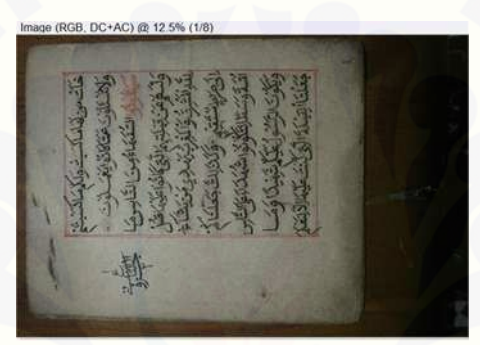
Figure 2. Image Captured By DSLR Camera Canon Eos M10 Mirrorless Camera using Canon Ef-M 15-45mm F/3.5-6.3 Is Stm Lense, Decoded With Jpegsnoop V 1.8.0.