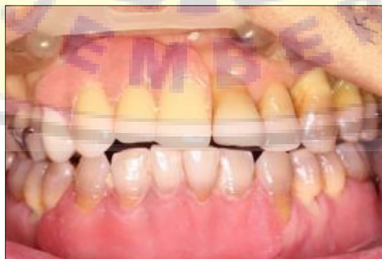
Figure 4 Metal frame partial denture insertion

The surgical wound was sutured with a simple interrupted suture using 4.0 Nylon at the incised mucosal margin to the connective tissue of the mesiobuccal fold. After that, the surgical wound was covered with periodontal dressing. Last, the patient is advised not to eat and drink hot for at least 1 hour postoperatively, take medicine as recommended