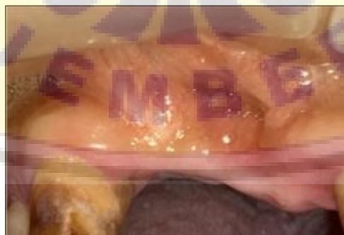
Figure 1 Before vestibuloplasty

A 52-year-old male patient came to the Department of Periodontics, Dental and Oral Hospital, Universitas Airlangga, with complaints that he wanted to clean tartar and replace missing teeth. Clinical examination found that the patient has a shallow vestibule and the width of the keratinized gingiva is inadequate, so treatment for deepening the vestibule is needed. The patient admitted to having a history of hypertension and routinely taking Amlodipine 10 mg once a day every morning. Vestibuloplasty to deepening of the vestibule was performed using the conventional surgical technique.