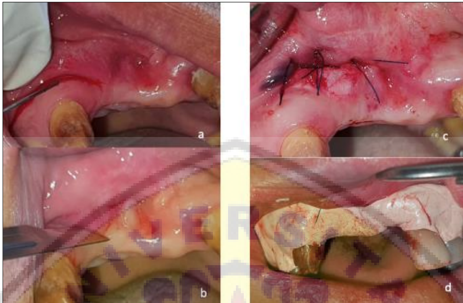
Figure 2 Vestibuloplasty procedure. a. Local anesthesia, b. Incision, c. Suturing, d. Periodontal dressing app

13. Partial-thickness flap using a scalpel on the area that has been incised to the limit mesiobuccal fold area next to the area where the vestibule is deepened. Irrigation using saline solution.