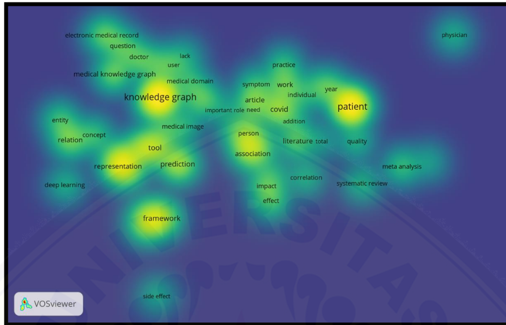
Figure 2. Density Visualization on Terms and Relationships

Five clusters were obtained after being analyzed using network visualization (red, blue, green, yellow, and purple), which showed the relationship between the research topic. In Figure 1, the keywords were labeled with colored circles depending on the cluster. The size of the circle was correlated to the number of terms occurrences on article metadata (more specifically, the title and abstract of the article). The more often a term occurred in article metadata, the greater size of the circles. Thus, it can be concluded that the size of the circle depended on the frequency of terms occurrence. As shown in Figure 2, the density visualization had the same way of displaying the terms as in the network visualization. Each point in the density visualization had a different color indicating the term density. The more significant number of terms occurrences, the red color will indicate the density. Contrary, the smaller number of terms occurrences will be indicated by the blue color.