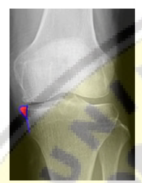
Figure 3. Osteophyte Area/OPA (red area)