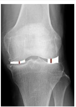
Figure 2. Minimum Joint Space Width / mJSW (red line)