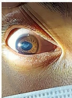
Figure 5 Right eye day 10