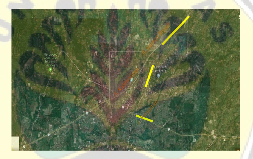
Figure 2. Research Object Location Map

The study was conducted on Jalan Panjaitan along 1.2 km, in front of Jember 1 Public High School (Between the Gladak Kembar red light to the RRI Jenber red light) which is one of the traffic jams in Jember City. The time of data collection is four days on 26 August 2019, 2 September 2019, 4 September 2019 and 7 September 2019. Technical Data collection in the morning at 6:00 to 8:00, noon at 11:00 to 13:00, and the afternoon at 15:00 to 17:00.