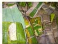
Tempeh wrapped in banana leaves