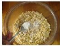
Giving yeast to soybean seeds