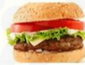
Burger Tempe

One of them is life-based learning with local wisdom for innovative biotech studies. Biotechnology fulfilled an integral part of human civilization, which has an essential position in scientific research [25]. Therefore, there is no reason for the teachers to argue that the obstacles of biotechnology learning are the limitation of materials and resources. The teacher training program should be more innovative and avoid discussing biotechnology topic [26].