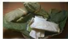
Tempeh wrapped in teak leaves