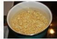
Soaking soybeans