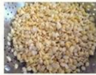
Drain the soybeans