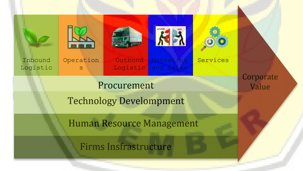
Figure 2.1 Value Chain Model (Porter el. al, 2002)

The Value Chain Model is a model introduced by Michael Porter in 1985 consisting of primary activities and supporting activities. This model describes the process in a company in identifying the main activities and supporting activities to add value to the product. Value Chain Analysis is a strategy used to analyse the company's internal activities and reveal where a company's competitive advantage or drawbacks are. In accordance with the concept of strategic CSR which is part of the company's value chain, the strategic CSR will also affect the process of transforming inputs (in this case slack resources) into outputs (in this case measured by the company's financial performance). In the concept of CSR, companies can also identify what CSR activities the company can do in every activity that is within the scope of primary activities and supporting activities.