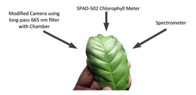
Fig. 2. Each leaf of Robusta coffee measured using three different tools.

B.T. Widjaja Putra, P. Soni / Data in Brief 21 (2018) 736-741