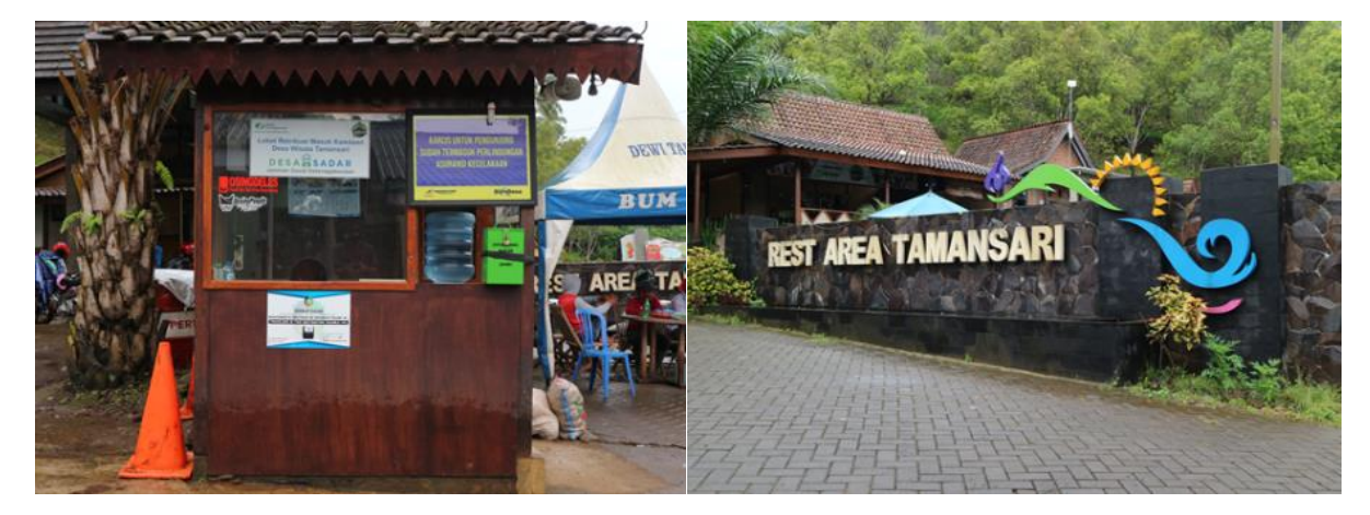
Figure 2. Tamansari Rest Area (Entrance gate to Ijen Crater Nature Reserve) managed by Village Owned Enterprise (source: photo by author, 2019).

The phenomenon of Blue Fire in Ijen Crater and bordering with the Blambangan Nature Reserve, the number of visitors has kept sharply increasing (Government Tamansari, 2018). Tamansari village located on the main road of the Ijen Crater therefore many tourists from within the country and abroad who visited and passed the Tamansari Village. With the increase of tourists, Tamansari shifting to be tourism village and community residents have gradually chosen tourism as their livelihood. Tamansari open the rest area and prepare the entrance gate and collect entrance fee within life insurance for tourists (Figure 2). Tamansari Village Owned Enterprise able to generate a turnover of IDR 40 million per month or IDR 480 million/year and contributes to the Village Revenue and Expenditure Budget (APBDes).