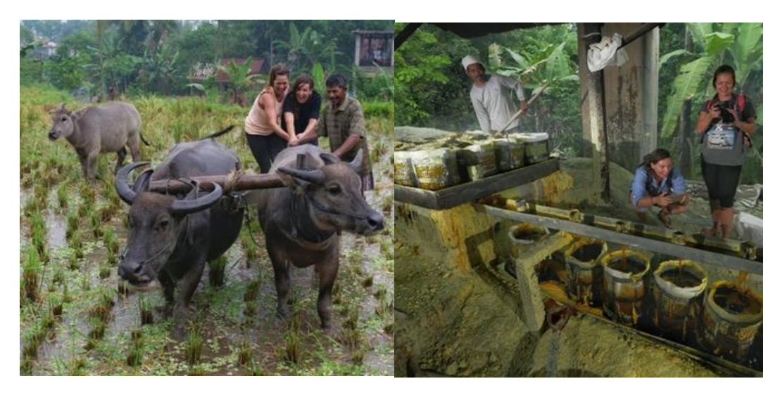
Figure 6. Village Tourism Activity (Buffalo ploughing attraction & Brown sugar making)

However, in this case, the local conferences programs discussed forthcoming year has not to touch sustainability issues. It is only limited to the provision of plant seeds, livestock breeds, construction of road and sewage infrastructure also foreign language training for village youth. Finding the issues of the important of the collaboration group business operators, including accommodation, attraction, and transportation not only improving the product quality but also increasing the inclusiveness practices. A commitment to monitor and forecast the demand and visitor satisfaction could be the good work for the group. It would be part to integration quality management in practice. The goals seeing improving of local awareness, encouraging partnership all the stakeholders for better integration to the greater involvement related to sustainable tourism business.