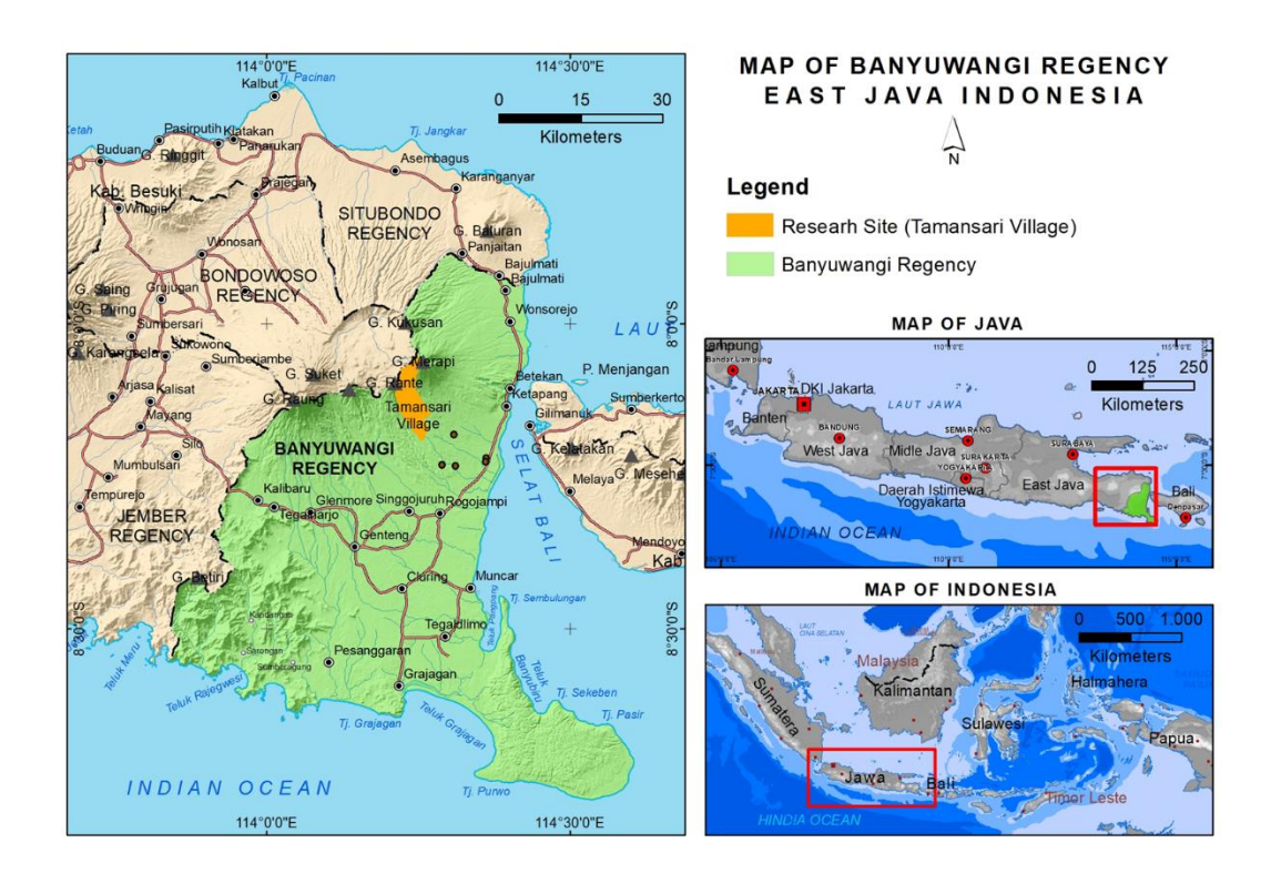
Figure 1. Local Map of Taman Sari Village.

The phenomenon of Blue Fire in Ijen Crater and bordering with the Blambangan Nature Reserve, the number of visitors has kept sharply increasing (Government Tamansari, 2018). Tamansari village located on the main road of the Ijen Crater therefore many tourists from within the country and abroad who visited and passed the Tamansari Village. With the increase of tourists, Tamansari shifting to be tourism village and community residents have gradually chosen tourism as their livelihood. Tamansari open the rest area and prepare the entrance gate and collect entrance fee within life insurance for tourists (Figure 2). Tamansari Village Owned Enterprise able to generate a turnover of IDR 40 million per month or IDR 480 million/year and contributes to the Village Revenue and Expenditure Budget (APBDes).