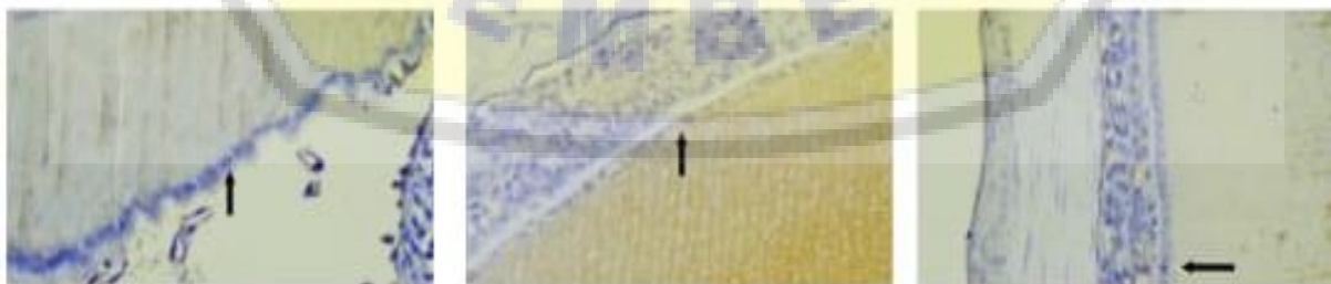
Fig.2: Photomicrographs of Nrf2 in the lens epithelium; (A) control group, (B) cataract-induction group, (C) cataract-induction and 200 mg/kgBW catechin group