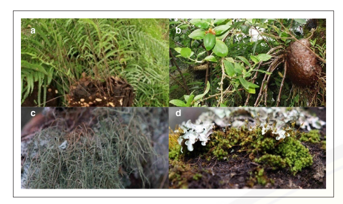
Figure 1. Indonesian epiphytic medicinal plants. (a Drynaria rigidula L, b Hynophytum formicarum jack, c Usnea misaminensis (Vain) Motyka and d Calymperes schmidtii broth.)

data analyzing these medicinal epiphytic plant, therefore, lead to this current investigation focusing on the chemical and bioactivity investigations of the extracts and fractions of these epiphytes. Specifically, we tested a range of biological activities; as examples, against Plasmodium falciparum given its prevalence in the region as well as the possibility of this microorganism being responsible for some of the symptoms treated in traditional medicine in the region, and against Mycobacterium tuberculosis as a surrogate for antimicrobial activity as well as being a microbe in which new treatments are still being investigated. We also tested against herpes simplex virus type 1, cancer cell lines, and cytoxicity testing.