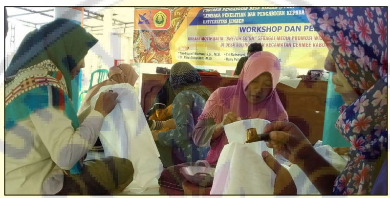
Figure 3. Wax scraping activities according to the flow of the batik patterns above the batik cloth

After processing the batik design, it is continued with the wax streaking on batik cloth (Figure 3). Wax is one of the most important components of making batik cloth. Wax that has been attached to the fabric with a Batik patterns will be used to cover the fabric, so that it will facilitate the process of coloring the batik patterns on the fabric. The wax material is preheated using medium hot coals. Batik waxs are thawed as needed. During heating, the wax that starts to melt is stirred slowly so that the wax material is evenly mixed. The use of buckets has advantages compared to the use of stoves to melt batik waxs. Buckets produce heat that is not too high so it does not result in the wax being too ripe or even burning. In addition, the use of buckets is cheaper and naturally environmentally friendly. The melting wax was immediately taken using a canting tool and then gently etched onto the white cloth by following the flow of the "Bhetoh So'on" batik patterns that had been designed by each participant.