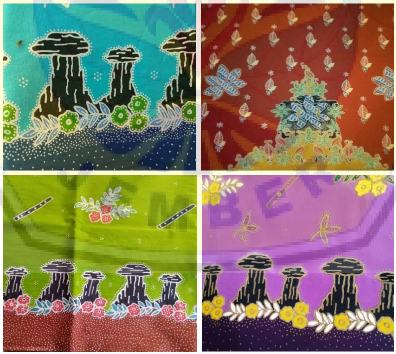
Figure 4. "Bhetoh So'on" batik patterns