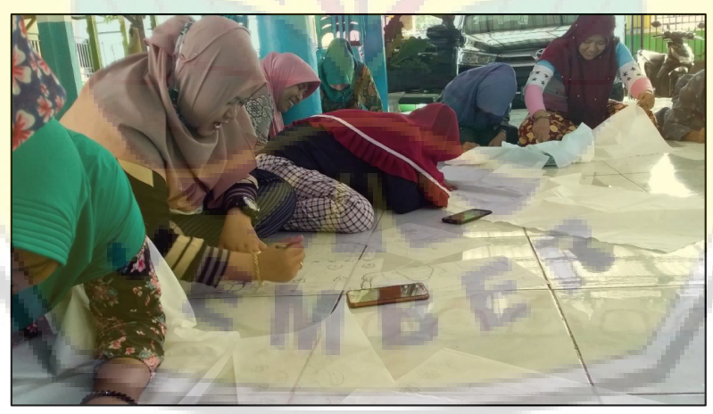
Figure 2. The activity of designing the "Bhetoh So'on" batik patterns on sketch paper

The training and assistance activities began by designing batik on paper using a pencil (Figure 2). The participants designed the "Bhetoh So'on" batik patterns in accordance with their respective concepts. "Bhetoh So'on" batik patterns in this activity are combined with environmental conditions around the Suling Wetan Village and Cermee District. Some participants designed batik with the main patterns "Bhetoh So'on" and other parts added with flutes and cermee musical instruments. It also added the patterns of coffee fruit and cassava leaves, which are plantation commodities in Bondowoso.