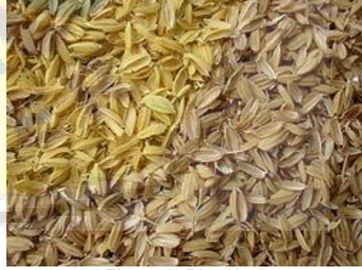
Figure 3. Rice Husk

Husks are parts of grains (cereals) in the form of dry sheets, scaly, and not edible, which protect the inside (endospermium and embryos).