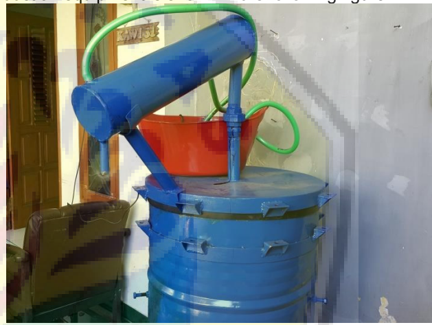
Figure 5. Liquid smoke production reactor

This activity was divided into 3 stages, namely counseling and training (workshops) accompanied by assistance. However, before describing the 3 steps, the Team of activities made the construction and installation of liquid smoke tools. The process of making liquid smoke production equipment. The initial stage made the components of liquid smoke production equipment consisting of (1) a container for collecting raw materials, used as a pyrolysis combustion reactor. (2) Tar collectors (3) condensers and (4) liquid smoke containers. Liquid smoke production equipment is shown in the following figure.