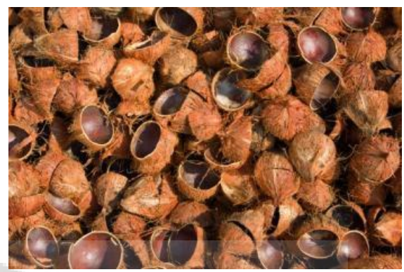
Figure 1. Coconut shell

The materials used to produce liquid smoke are biomass waste, namely coconut shells, corncobs and rice husks. Coconut shell is a part of coconut fruit in the form of endocrap, which is hard, and covered by coconut fiber. Coconut shell is usually used as a craft material, fuel, and briquettes. Coconut shell that is processed can produce valuable added value.