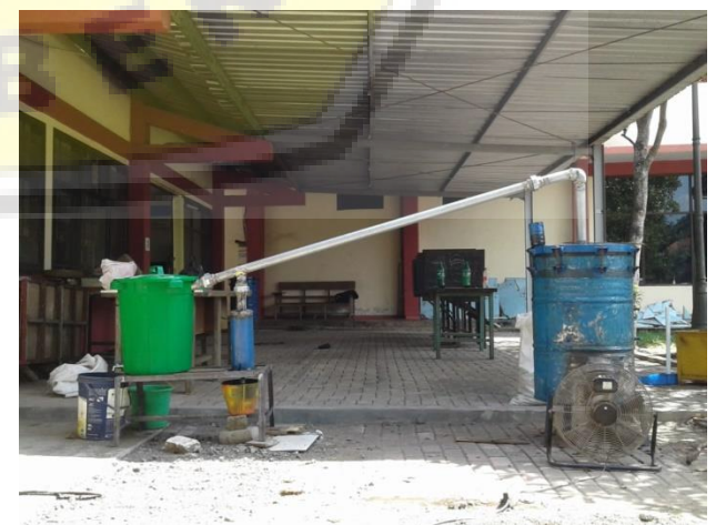
Figure 6. Modification of Liquid Smoke Production Equipment.

The design of the liquid smoke production equipment above produces less liquid smoke and the product is still mixed with TAR so it produces a black product. Next, it is evaluated and improvements are made to obtain tools such as the following figure,