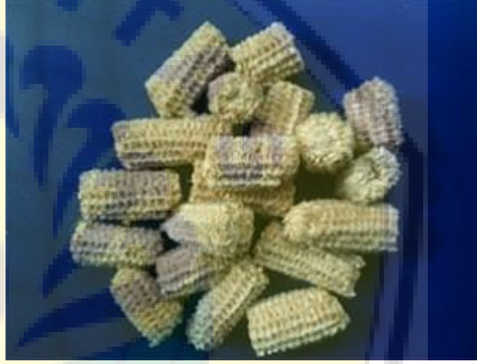
Figure 2. Corncobs

Corn cobs are the inside of the female organ where the grains sit attached. This term is also used to refer to all parts of female corn ("corn fruit"). The cob is wrapped in klobot ("corn fruit" skin). Morphologically, corncobs are the main stems of modified panicles.