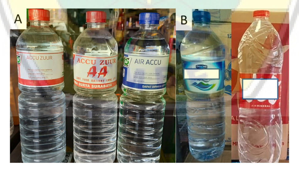
Fig. 2. A. Accu water (H_2SO_4) , B. Drink water.

pyloric mucous will induce progressive tissue inflammation that indirectly will cause pyloric obstruction. The pyloric obstruction will appear commonly 4–6 weeks after ingestion [7]. In this case, the pyloric obstruction occurred 30 days after ingestion.