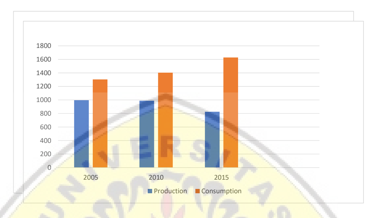
Figure 1. Indonesia's Oil Production and Consumption (Millions Barrel/Day) [12, 14]

It can be said that the reactivation of Indonesia in OPEC is part of the strategy in the economic development program [13]. Indonesia obtained an increase in Gross Domestic Product (GDP) to approximately 5 or 6%. Indeed, it was expected that the increase would continue in the next few years. Building on this condition, Indonesia needs a lot of energy to maintain its economic growth. On the other hand, as a net oil importer, Indonesia needs a guarantee that oil-producing countries especially the member of OPEC continue to export their oil to Indonesia.