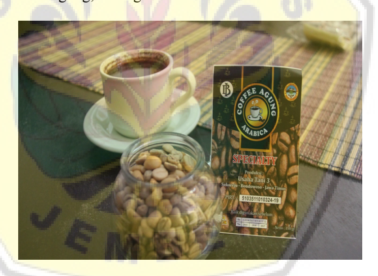
Fig. 5 Product of Suheri (Research Documentation)

3. Coffee Agung; belongs to Suheri from Usaha Tani III.