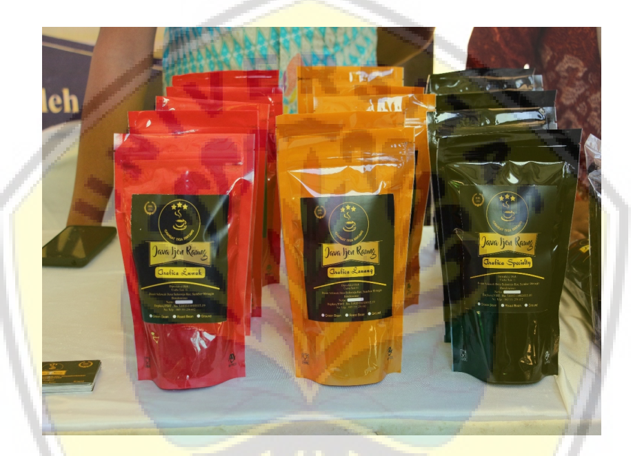
Fig. 6 Product of Muali (Research Documentation)