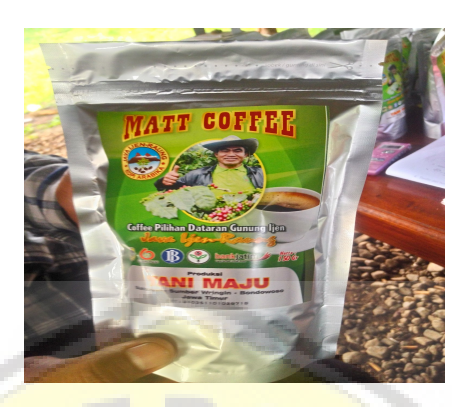
Fig. 7 Product of Mathosen (Research Documentation)

14. Kepodang Mas; belongs to Harnimo from Tani Maju III group.