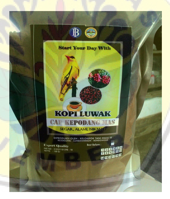
Fig. 8 Product of Harnimo (Research Documentation)

14. Kepodang Mas; belongs to Harnimo from Tani Maju III group.