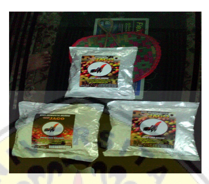
Fig. 10 Product of Bahriman (Research Documentation)