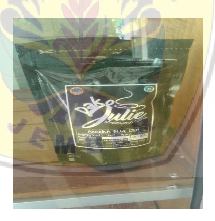
Fig. 11 Product of Chief of Cooperation Suyitno