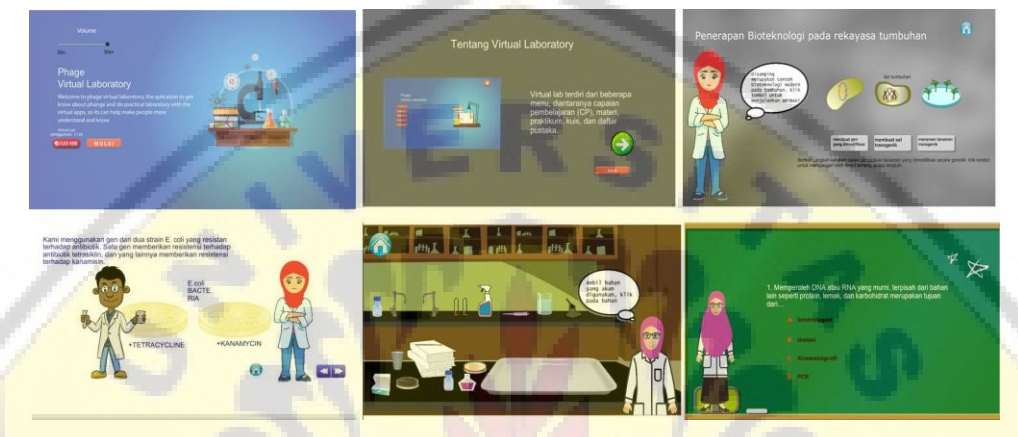
Figure 1. Screenshot Menu of Virtual Laboratory

Before the testing stage, validation for the product will be applied first. The validator consists of 6 experts, namely: two material experts who will assess the feasibility of content, presentation, and language; two media development experts who will assess the feasibility of graphics in the book and virtual laboratory (Figure 1) as well as two learning media development experts. Moreover, two other validators, as users, precisely two lecturers of biotechnology courses who will assess the feasibility of content, presentation, language, graphic book, and virtual laboratory when applied in the learning. If it has been declared valid, hereafter, a trial is conducted to determine its effect on the pre-service teacher's TPACK.