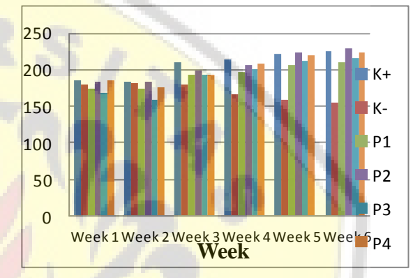
Figure 2. Comparison of Weight Variations Along The Treatment Weeks and Groups or Treatment