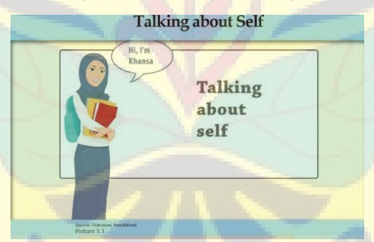
Figure 4. An illustration of a female student wearing hijab

Appreciating women's equal rights (AWER) are represented through an illustration of a female student wearing hijab, a female student reading in a library, two women with different dress styles, a portrait of an international woman singer, and portraits of Cut Nyak Dhien, as one of the heroines in Indonesian independence. In this section, the illustration of a female student wearing hijab was chosen as one of the representative images showing the values of AWER due to space limitation and a trend on the use of hijab among female teenagers in the Indonesian school context. This illustration is placed at the beginning of the unit, in which the teacher can facilitate students to observe the socio-cultural phenomena that happen in Indonesian schools related to the form of appreciating women's equal rights. One of the illustrations that represents AWER that was analyzed may be found in Unit 1: Talking about Self, Learning objective, p. 1 (see Figure 4).