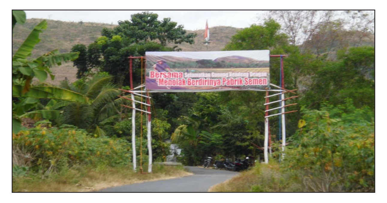
Picture 3: A Poster in the Village Gate Resisting the Establishment of Cement Factory

The Saminist Movement of the Kendeng Mountains Complex of Java