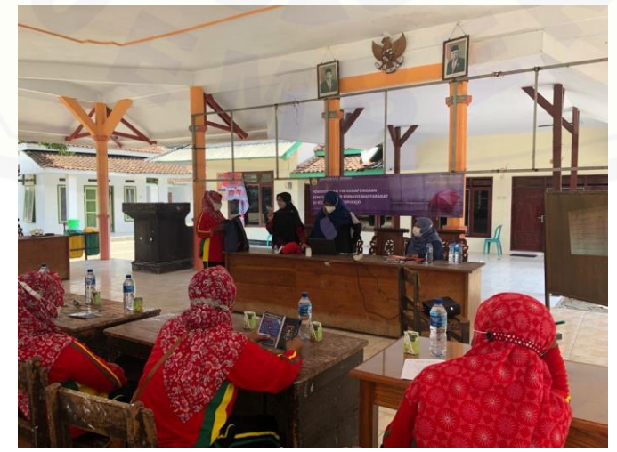
Figure 4. Simulation of Preparing Disaster Preparedness Bag

The flood alert simulation activity is carried out by direct practice from what has been conveyed in the counseling material. This session was 30 minutes. The speaker gave an example of how we respond to flood disasters. This activity includes actions that must be taken when a flood disaster occurs. In this activity, participants were trained about what needs to be recognized to read the symptoms of a flood disaster. After the signs of symptoms increase, what are the following steps to take, including securing electronic goods or other items in a higher place, turning off all electric currents, and placing disaster alert bags that have been prepared in advance so that they are easily accessible during emergency conditions? Immediately evacuate ourselves when the water flow gets higher to the designated evacuation route. After that, participants were asked to simulate one by one directly the steps that need to be taken if a flood occurs, such as a family emergency plan; they should also mention the ten most essential items required and must be carried (in a bag) during a disaster (figure 4). The result was 9 out of 10 participants could practice it perfectly in the allotted time.