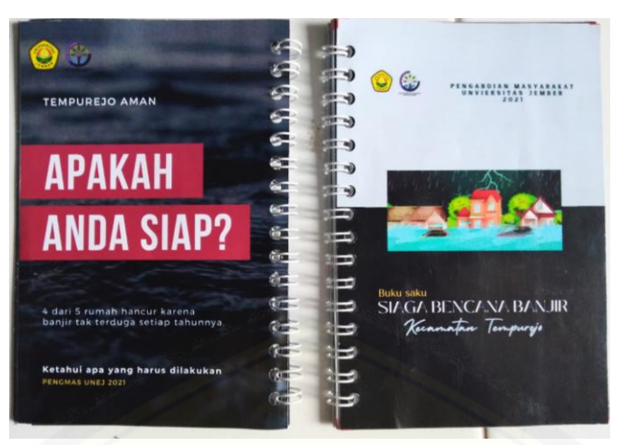
Figure 3. Disaster Preparedness Team Guidance Pocketbook Stage 3: Flood preparedness training

The flood alert simulation activity is carried out by direct practice from what has been conveyed in the counseling material. This session was 30 minutes. The speaker gave an example of how we respond to flood disasters. This activity includes actions that must be taken when a flood disaster occurs. In this activity, participants were trained about what needs to be recognized to read the symptoms of a flood disaster. After the signs of symptoms increase, what are the following steps to take, including securing electronic goods or other items in a higher place, turning off all electric currents, and placing disaster alert bags that have been prepared in advance so that they are easily accessible during emergency conditions? Immediately evacuate ourselves when the water flow gets higher to the designated evacuation route. After that, participants were asked to simulate one by one directly the steps that need to be taken if a flood occurs, such as a family emergency plan; they should also mention the ten most essential items required and must be carried (in a bag) during a disaster (figure 4). The result was 9 out of 10 participants could practice it perfectly in the allotted time.