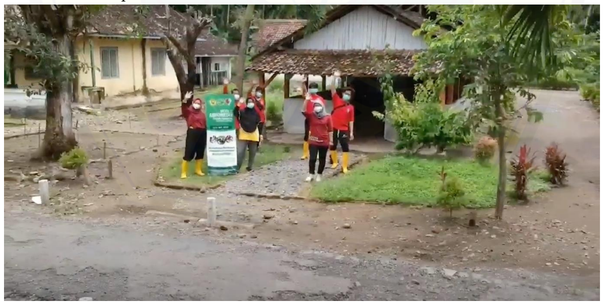
Figure 1. Preliminary Survey after Flood

The urgency of this community service is to increase the capacity of the community in dealing with flood disasters through increasing knowledge about what activities need to be done when dealing with floods and the risks of diseases that may be suffered after the disaster. It is hoped that by increasing the community's capacity to read the risks that may occur during a flood and be able to self-evaluate. In addition, it is hoped that the public will know the potential for diseases that may arise in each individual and be able to prevent and overcome the illness so that the severity of the condition does not occur. Community capacity building is also expected to be able to minimize the impact of disasters.