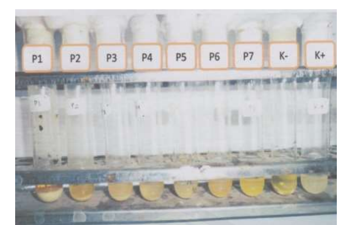
Figure 1. MIC test results that show turbidity level on each tube