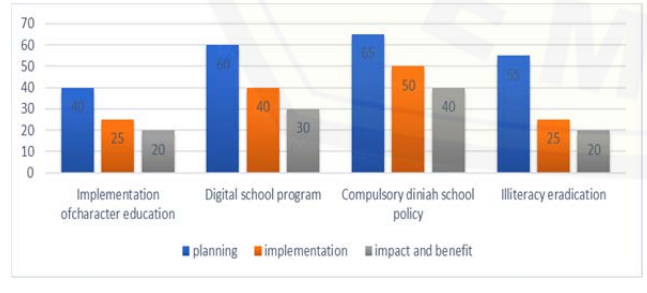
Figure 1. Education policy implementation

The attention and commitment of the Sumenep and Bangkalan governments to education can be seen in 4 (four) education policies, namely: implementation of character education, implementation of digital school programs, compulsory early education policies, and implementation of illiteracy alleviation policies.