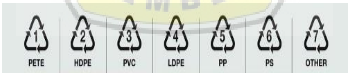
Figure 1. Identification Types of Plastic

The high frequency of plastic usage in human activity is occurred due to its advantages. The dangerous substance contained in plastic isn't considered as crucial issue. In fact, plastic, indeed, provides plenty beneficials in human daily activities [9]. The main problem in consuming plastic lies in the littering waste of plastic which is considered as unable to recycle. In fact, human being will consciously do plastic littering since their self-awareness of managing and responding plastic littering is still at low level. Littering in long time period will cause an extreme damage toward environment [12].