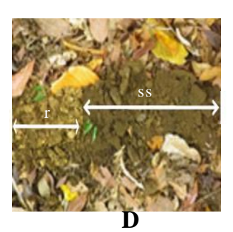
Figure 2. (A.) Direct measurements of soil temperature, moisture, and pH; (B.) Soil coring at the site; (C.) extracted soil sample from the pit; (D.) SS is soil solum; r is regolith.