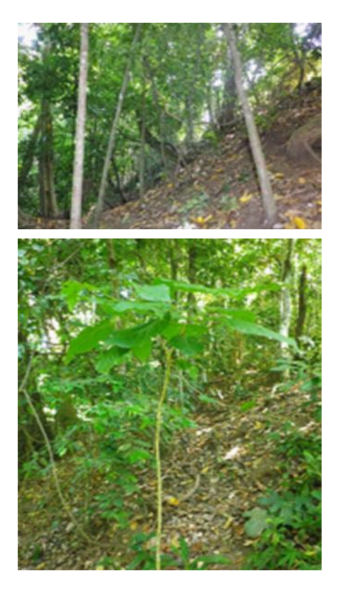
Figure 4. The different angles and degrees of the slopes (red arrows).