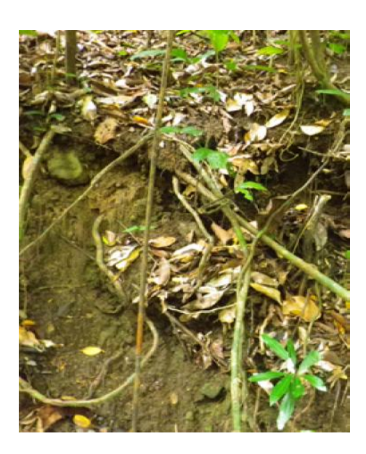
Figure 3. The variation of soil solum depths (red line double arrow).

The ecological base value of function can be charged by carbon credit (c) based on carbon content pricing and/ or resource offset based on transaction cost in USD. The standard price of carbon credit which is in the range of 7-20 USD Mg CO<sub>2</sub> prices was taken from the Consolidation Report: Reducing Emissions from Deforestation and Forest Degradation in Indonesia published by FORDA Indonesia (MOFOR 2008). Therefore 3.667 was used to convert carbon content into CO<sub>2</sub>