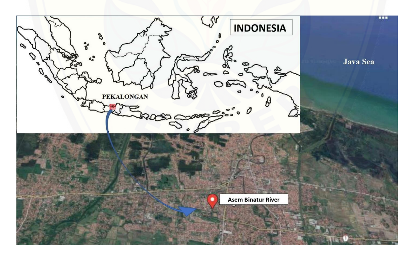
Figure 1. Location of the Asem Binatur River, Pekalongan, Indonesia

Collection of dragonflies was conducted in the morning from 07.00 until 10.00 hours. The observation time was 30 minutes at each station using a long high hand net, wrapping paper or papilot and camera at eight stations. A point count method was used with the distance in between observation points of about 50 m. Each sampling station consisted of three observation points. The species of dragonflies were identified and counted in-situ and counted. The main