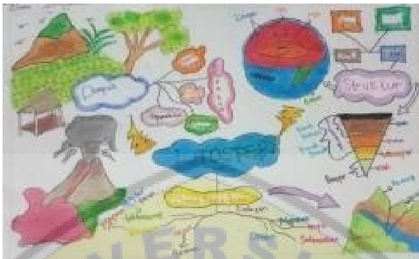
Figure 3:- Mind Mapping about the layer of earth from students' results.