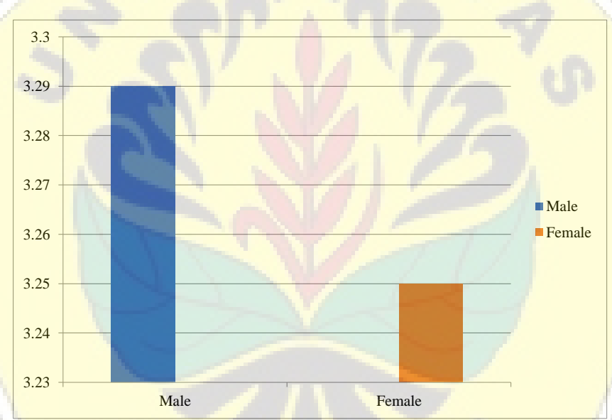
Figure 2. Technological Content Knowledge Diagram Graph Based on Gender

Based on gender differences, the percentage obtained is male, 36.4% while the percentage of female is 63.6%.