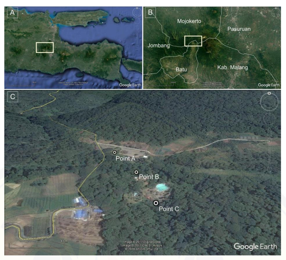
Figure 1. Research location, (a) location on the map of East Java, (b) adjacent location on the Mojokerto-Batu border, (c) distribution of locations into three points: A, B, and C

AS Kurnianto, A Sugiharto, N Kurniawan, 2020 / Looking on Indigo Flycatcher Hunting Behaviour