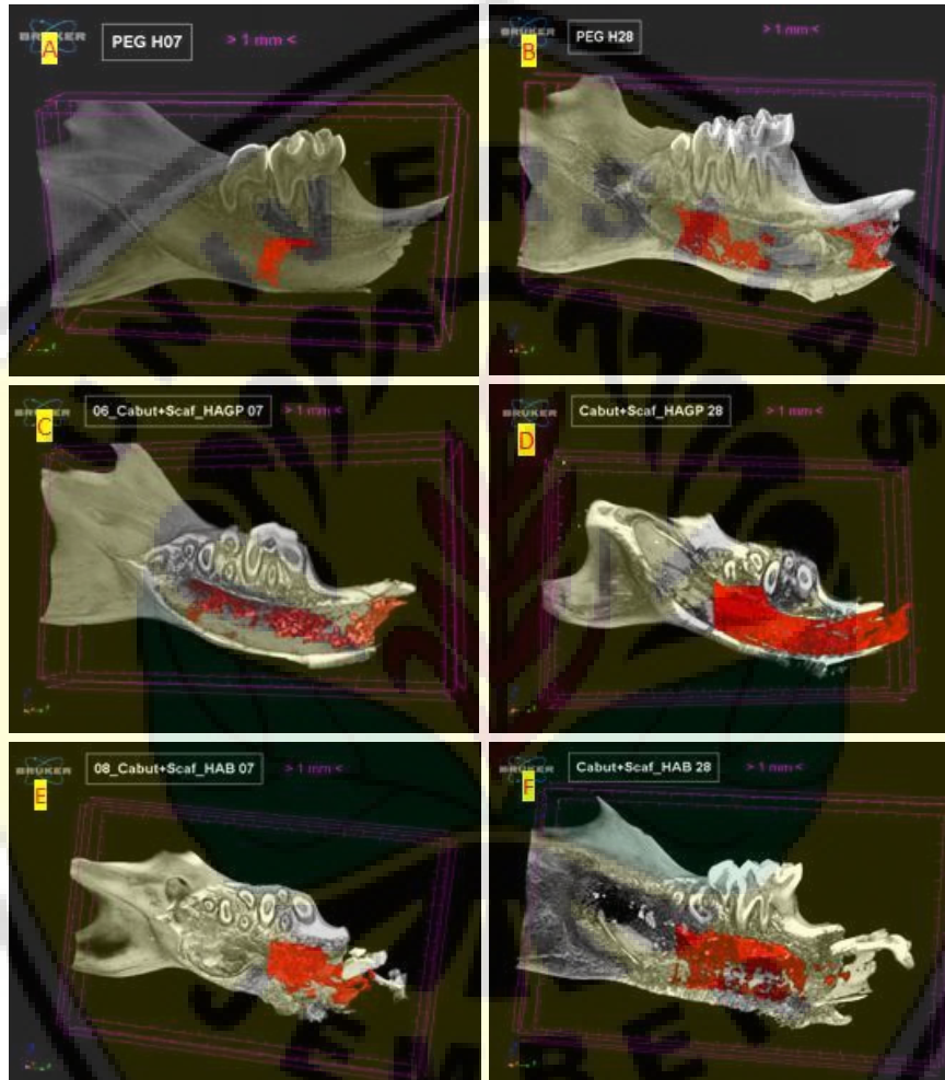
Figure 2. The results of bone density volume analysis are shown in red: (A) K (-) PEG 7, (B) K (-) PEG 28, (C) HAGP + PEG 7, (D) HAGP + PEG 28, (E) BHA + PEG 7, and (F) BHA + PEG 28.