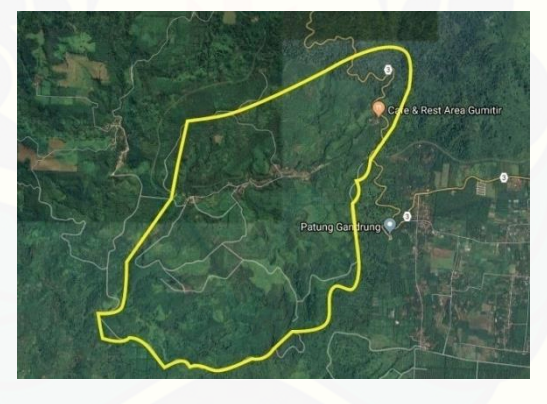
Figure 2. Gumitir Mountain Area

The Gumitir Mountain area has a high biodiversity. Moss plant, ferns, to seed plants can be found in the region. Windari (2015) stated that there are 29 kinds of ferns in the area of Gumitir Mountain. Biotic factors greatly affect the vegetation that grows in the area. The Gumitir Mountain area is dominated by trees, making the area shady and cool where it supports the growth of vegetation, including lichen. The abiotic factors that affect the growth of vegetation in the region are soil acidity (pH), soil moisture, air humidity, temperature, light intensity, and wind speed. The Gumitir Mountain area has an average soil pH at 6.85; soil moisture at 15%; air humidity at 61.5%; temperature at 29.5°C; light intensity at 350.5 lux; and wind speeds at 18 m /s (Windari, 2015). The Gumitir Mountain area can be seen in Figure 2.