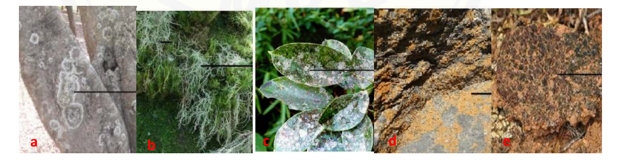
Figure 3 . Types of lichenes based on habitat. a) corticolous, b) muscicolous, c) fllicolous, d) saxicolous, e) tericolous lichenes. (taken from Roziaty, 2016).

According to Roziaty (2016), Lichen divide into several group based on habitat, that are corticolous, muscicolous, follicolous, saxicolous and tericolous lichenes. As describes in Figure 3 .